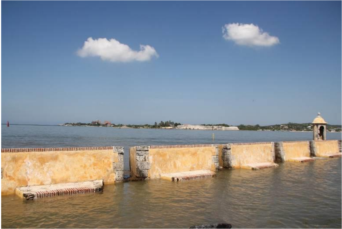
Photographs 25 and 26: The fortress of San José de Bocachica during the visit made by the mission at the time of an unusually high tide that completely overwhelmed it.