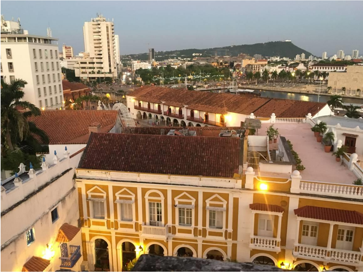
Photograph 5: San Felipe Castle besieged by the Aquarela Project. View from the Historic Centre