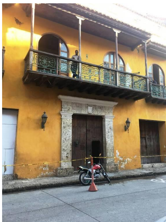
Photograph 14: Typical house of the Historic Centre recovered by the Ministry of Culture to create a cultural and gastronomic space open to the community