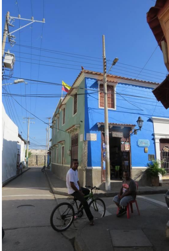
Photographs 17 and 18: The Historic Centre, Getsemani neighborhood, presents a regular state of conservation but its use still maintains its authenticity.