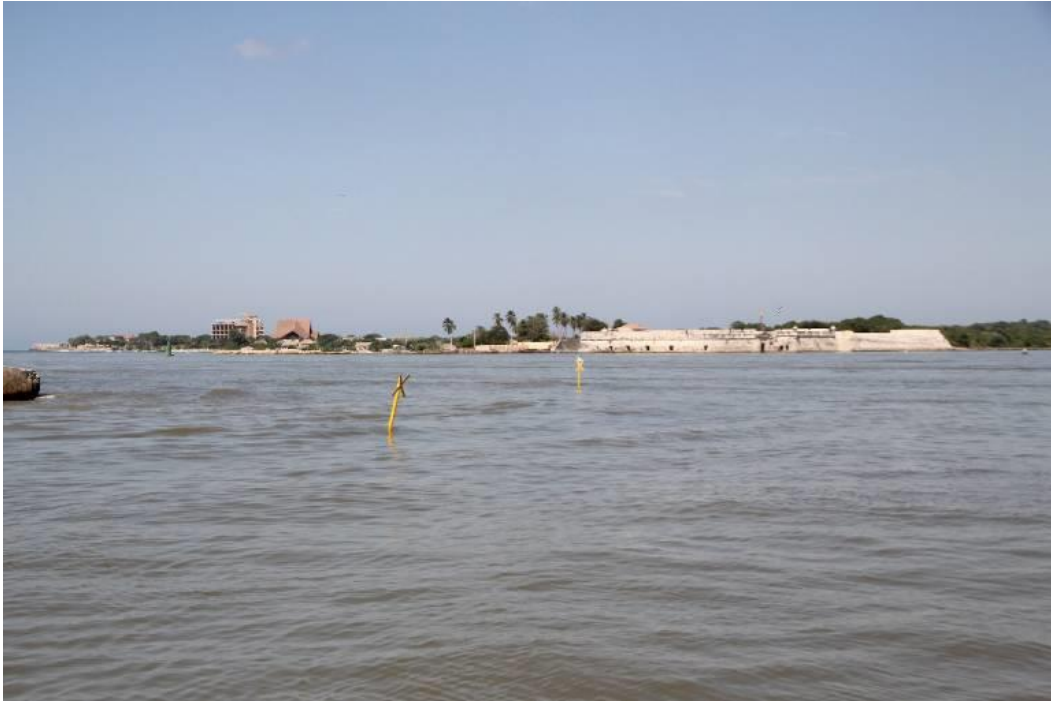
Photographs 6 and 7: View of San Fernando fortress from San José fortress in Bocachica. On the left can be seen some buildings that visually impact the environment.