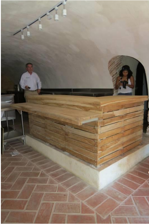
Photograph 30: The bastion of Santa Bárbara has been conditioned to carry out gastronomic activities with the participation of residents of the Getsemaní neighborhood.