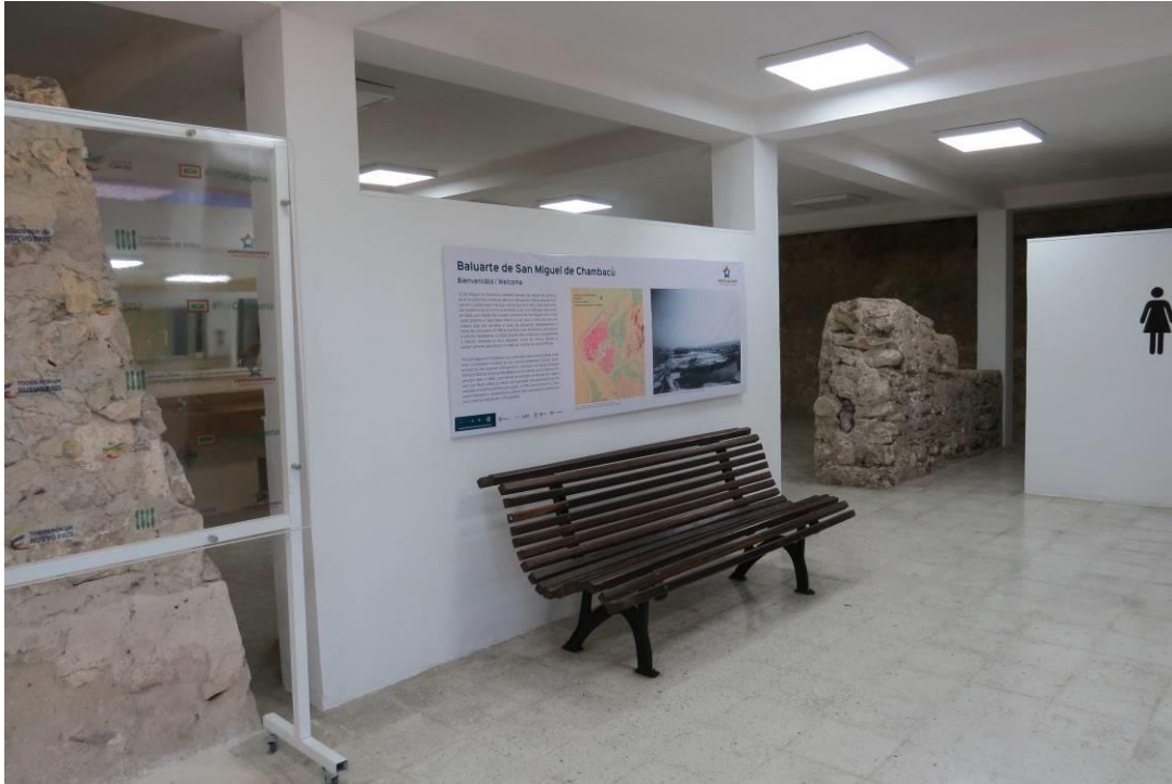
Photograph 29: Bathrooms in the bastion of San Miguel de Champacú in which archaeological remains of ancient walls have been integrated.