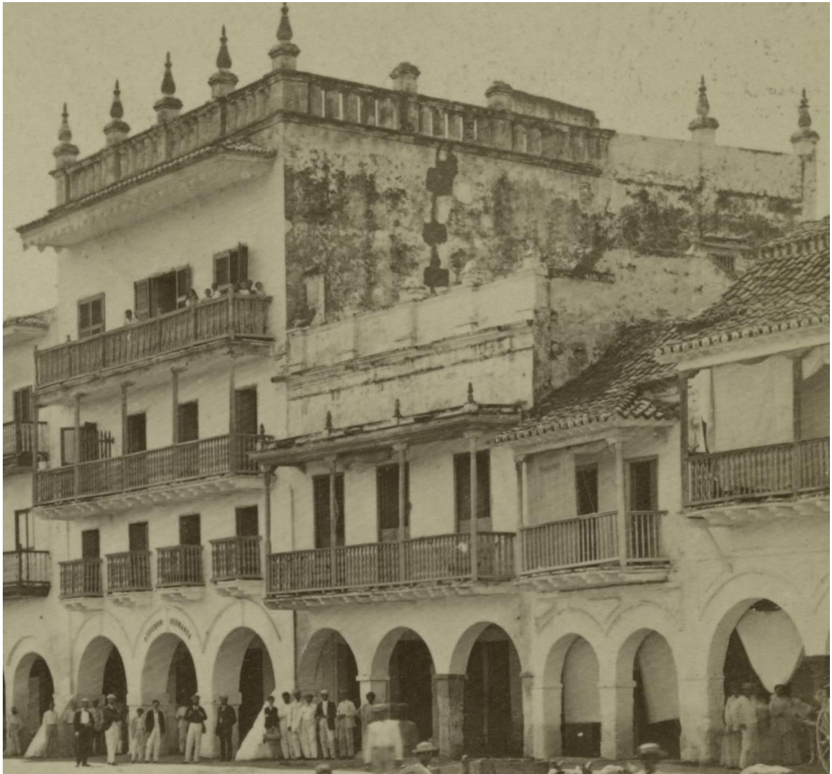
Photograph 8: The Portal de los Dulces between 1871 and 1873. The second and third buildings from the left correspond to the current Hotel Santa Catalina. The original roofs of both buildings can be seen.