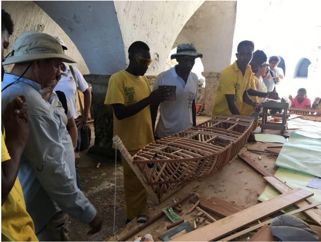
Photographs 27 and 28: The fortress of San Fernando de Bocachica with students from ETCAR making a model as part of their training in rimmed carpentry and the laboratory set up to carry out conservation works on objects recovered in underwater investigations.