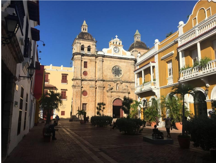
Photograph 11: San Pedro Claver, one of the few religious complexes of the Historic Centre that conserves its original use.