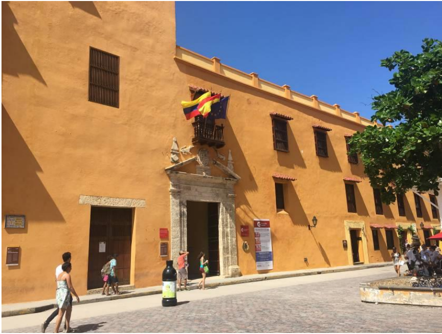
Photograph 12: The convent of Santo Domingo has been converted into a cultural space accessible by the public.