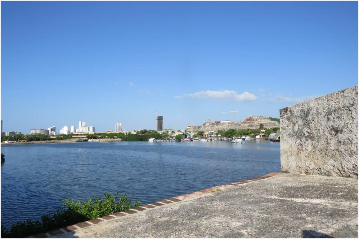
Photographs 3 and 4: San Felipe Castle besieged by the Aquarela Project. View from the San Miguel de Champacú bastion.