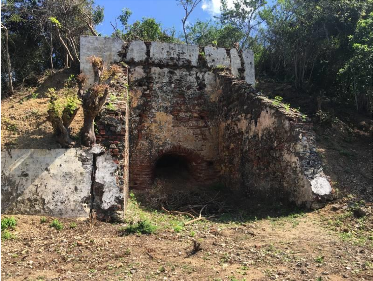
Photograph 33: Lime furnace in the vicinity of the Bay