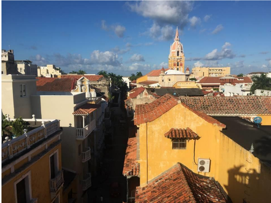
Photographs 15 and 16: The Historic Centre, neighborhood of the Cathedral, presents a good state of conservation but also an intense tourist use and a process of gentrification that threatens its authenticity.