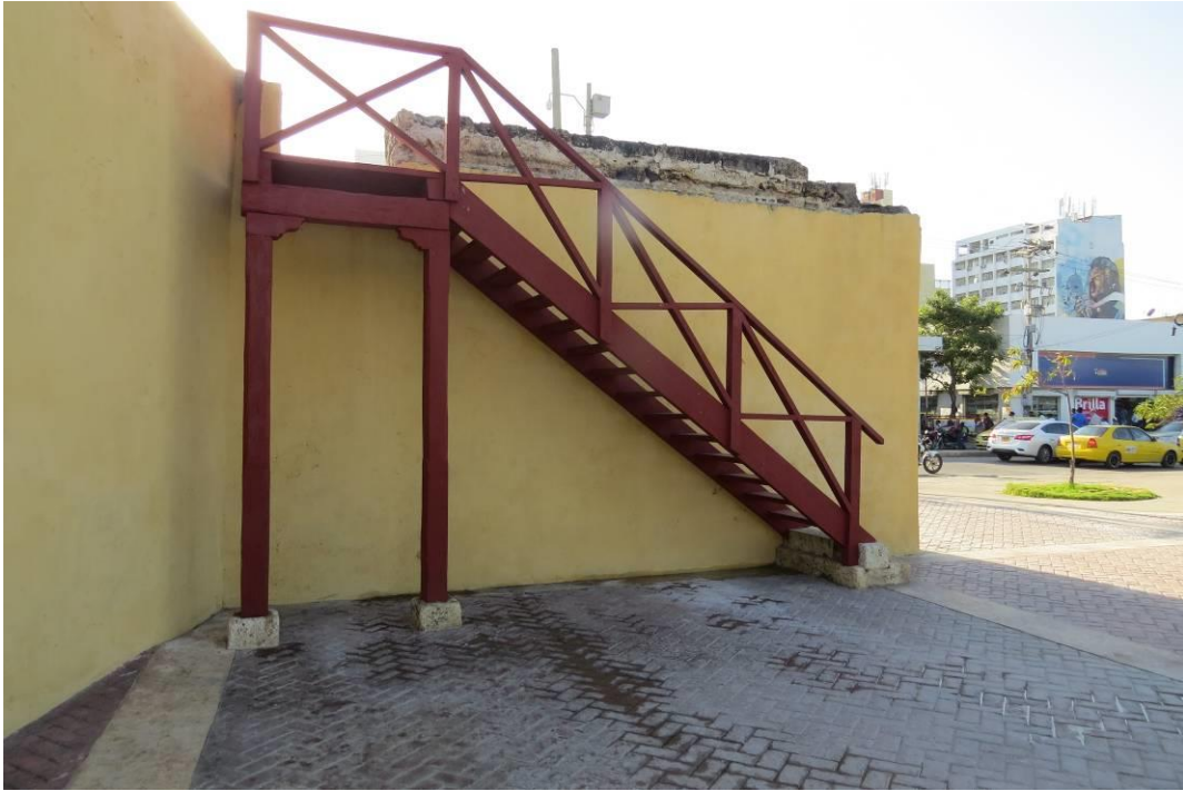
Photographs 31 and 32: Ladders made and installed by ETCAR to allow access to the walls