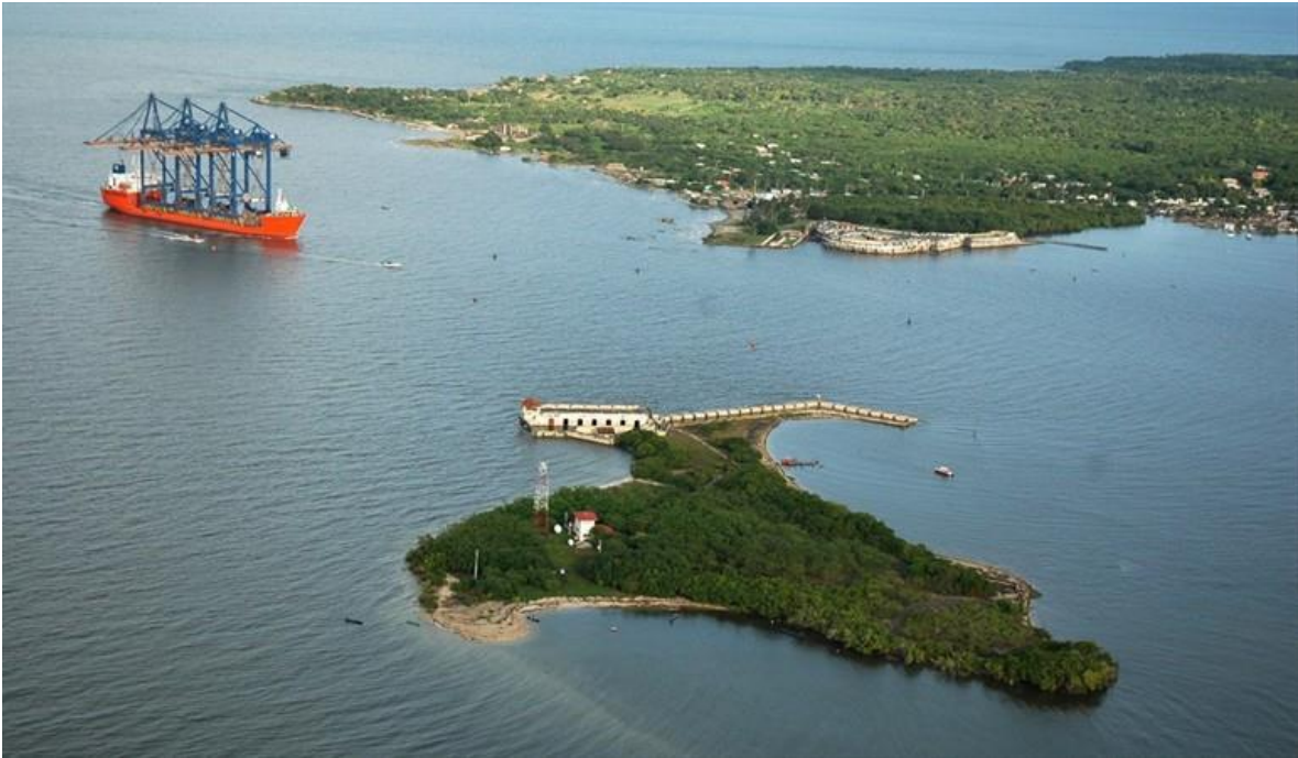
Photograph 21: View of the access channel to the Bay of Cartagena between the fortresses of San Fernando and San José de Bocachica.