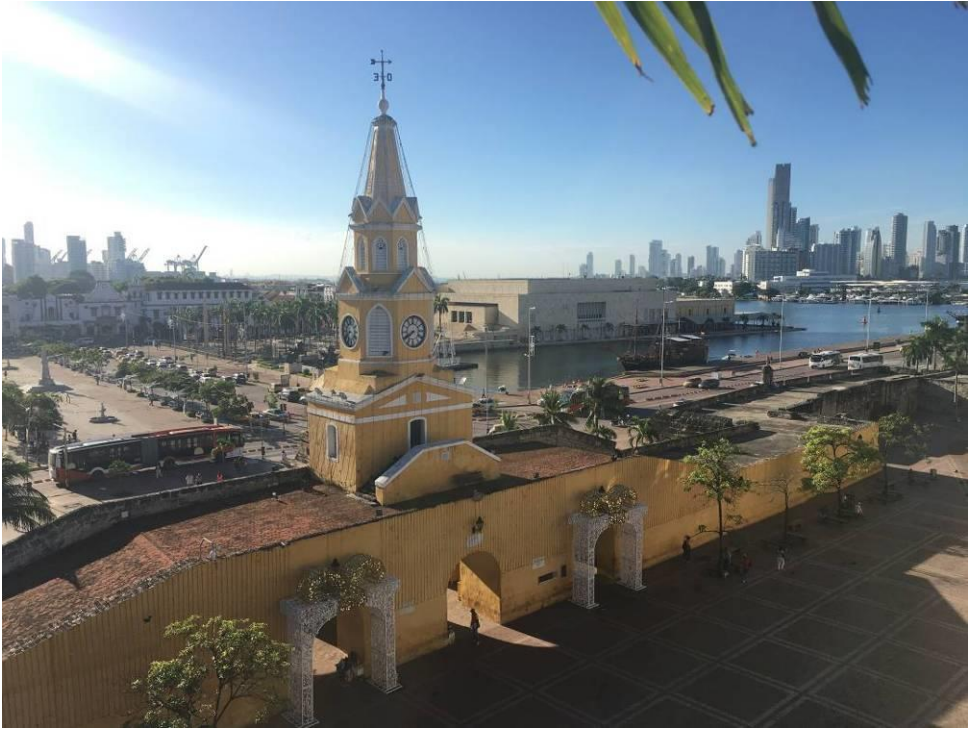
Photograph 1: The Historic Centre besieged by high buildings. View from Plaza de los Coches towards the port and Bocagrande