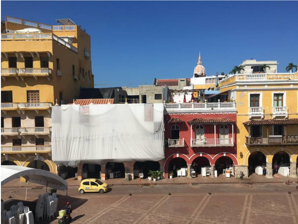
Photographs 9 and 10: The current work on the Hotel Santa Catalina building. The addition of a top floor is visible from the Plaza de los Coches .