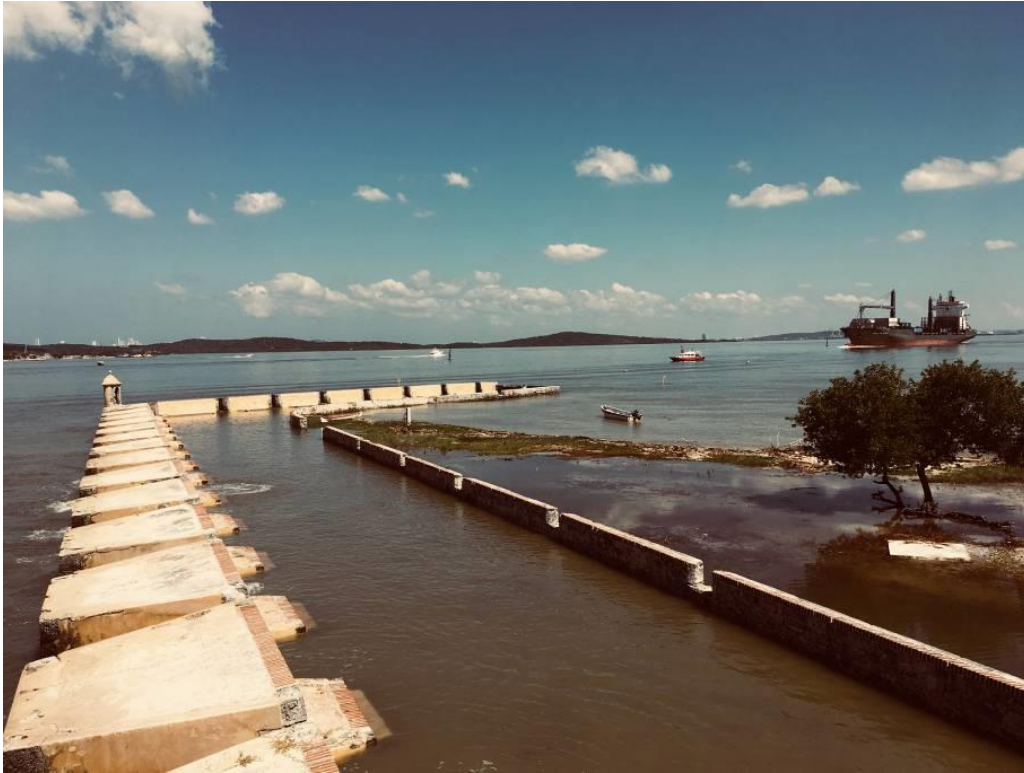
Photographs 23 and 24: The fortress of San José de Bocachica during the visit made by the mission at the time of an unusually high tide that completely overwhelmed it.