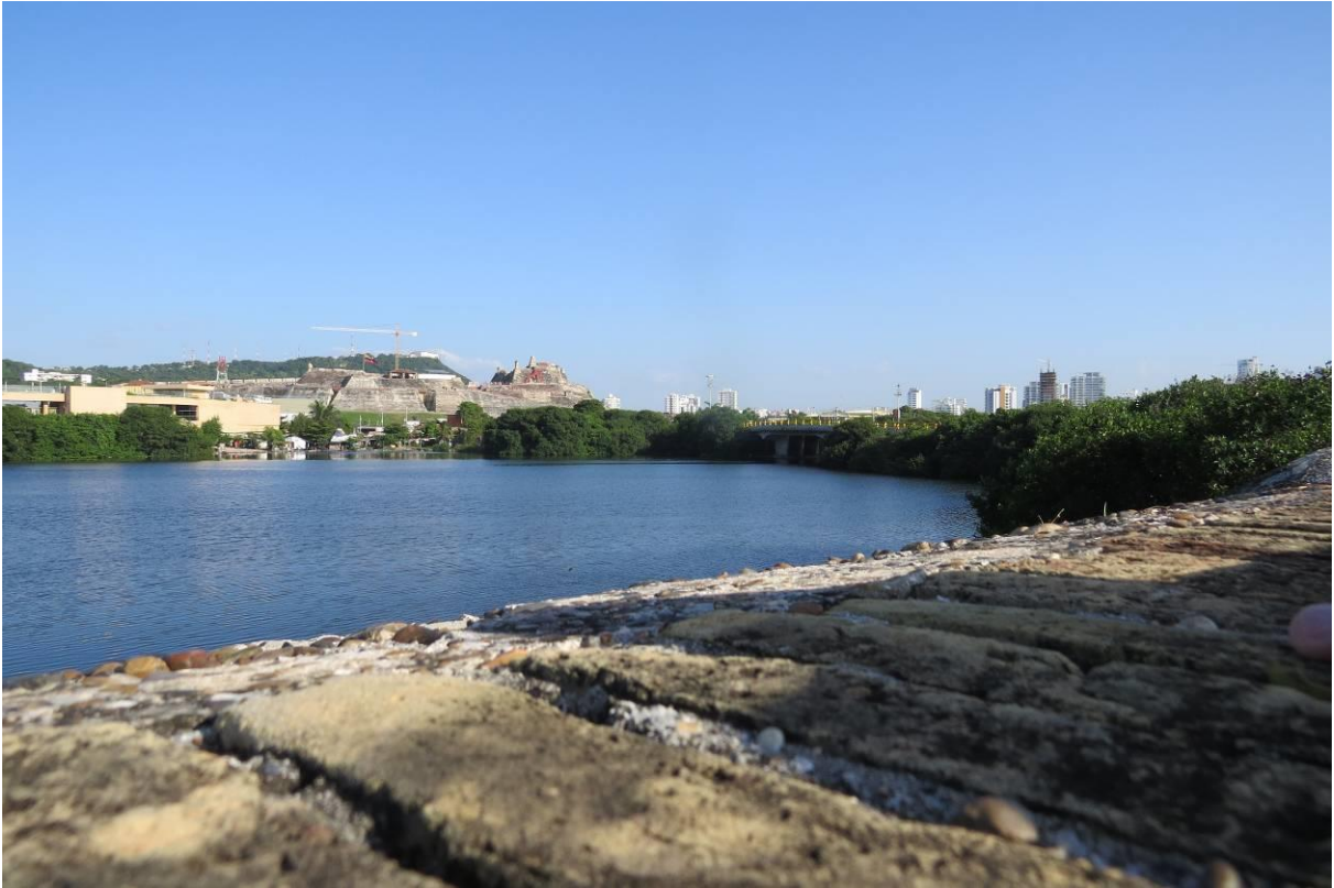
Photographs 19 and 20: The walls are the object of a satisfactory job of conservation and maintenance carried out by ETCAR. However, the mangrove vegetation in the canal should be eliminated.