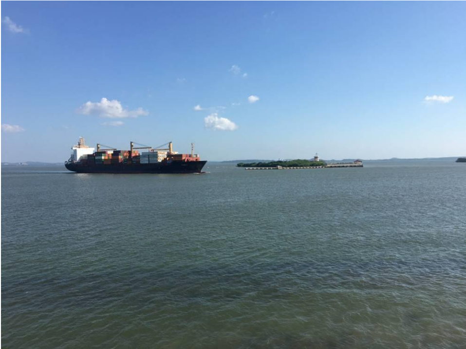
Photograph 22: View of the access channel from the fortress of San Fernando de Bocachica while a Panamax vessel passes. In the foreground, a dark line in the water indicates the maritime protection of the fortress. In the background, the fortress of San José can be seen.