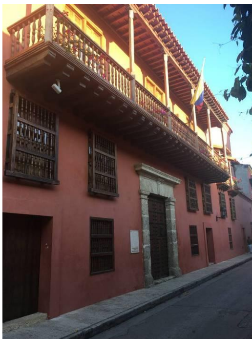
Photograph 13: One of the most emblematic and important historic buildings in Cartagena, that is currently used for private functions.