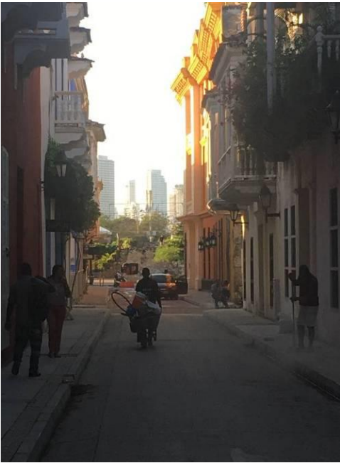
Photograph 2: The Historic Centre besieged by high buildings. View from one of the streets intra-walls.